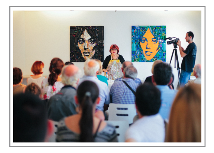
Demo on Yupo and Terraskin Papers in conjunction with Show