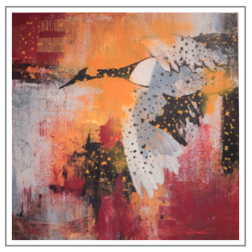
"Canada Goose" 36"x 36" acrylic on canvas by D.D. Gadajanski Collection Canadian Embassy in Belgrade,

"Canada" Acrylic on canvas 36"x36"x 2 Dyptich (36"x72") Collection Canadian Embassy in Belgrade, Serbia