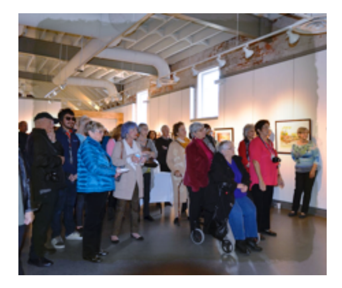
Fall Show Opening at Todmorden Mills Gallery