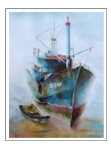
The Day's Done