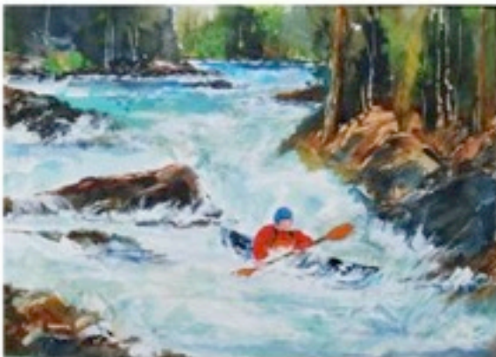
"Where the River Gets Feisty " 15" x 22" watercolour