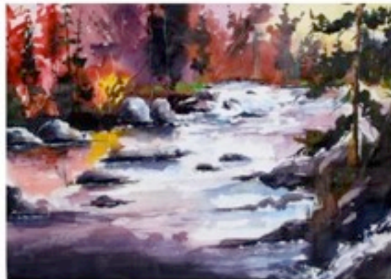
"Mother Nature's Wardrobe " 15" x 22" watercolour