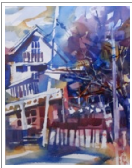
Colours of Kensington