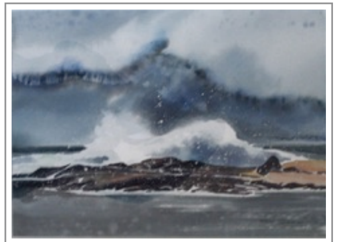
Prospect Point Spectacular

This is a successful combination of representational segment with the looseness of more abstract qualities. The white areas of the page showing through give the work energy.