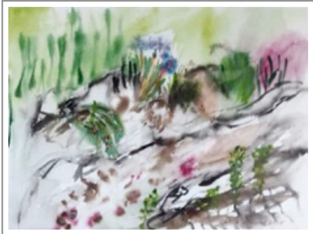
En Plein Aire - Le Marais