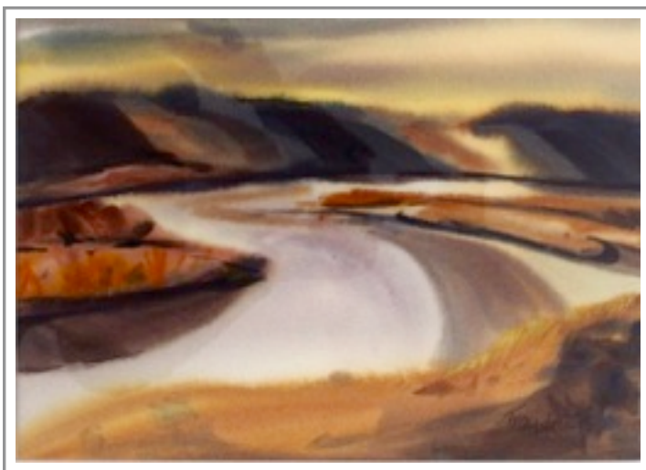
The Bow River

You think Canadian as soon as you look at it. This is an excellent showcase of wet-in-wet watercolour technique. The painting is very confident: it takes your eye where the artist wants it to go. It achieves a lot with very little.