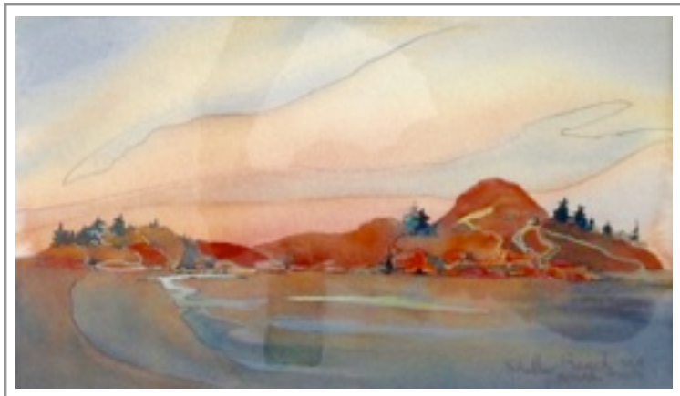
Journey to Dreamer's Rock