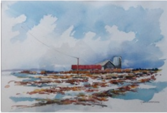
Waiting for Spring