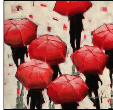
Eleanor Lowden: It's our little secret

On display along the Main Corridor of Sunnybrook Hospital Sep 11 to Oct 18, 2018