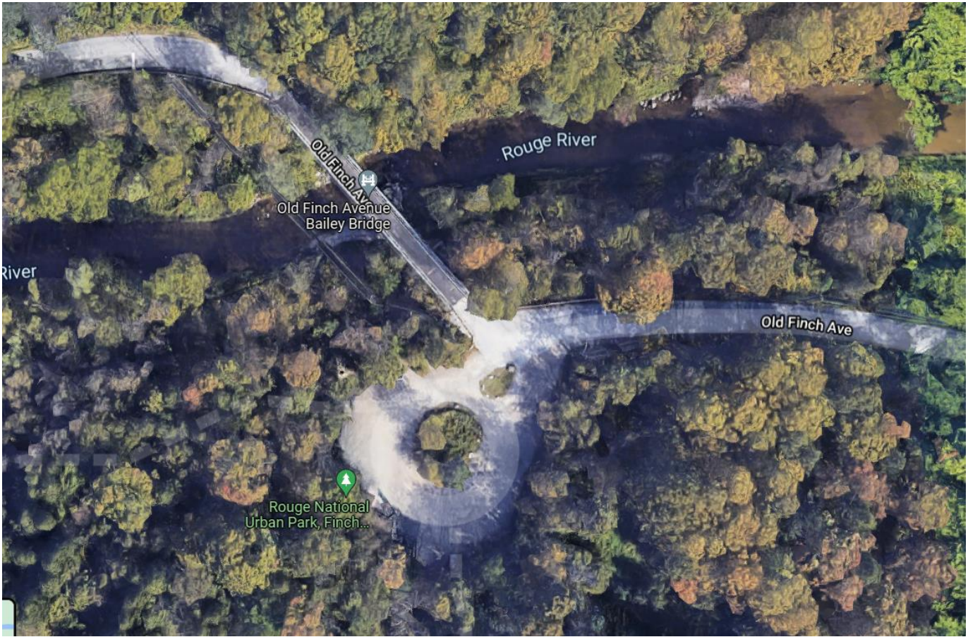
Here are the landmarks as you arrive to the Rouge River single lane bridge, and once you cross it