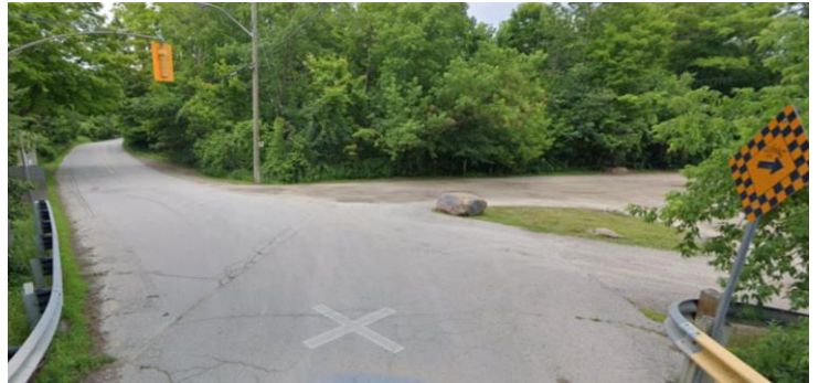
Look for the Rouge Park sign to the parking lot.